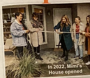
In 2022, Mimi's House opened